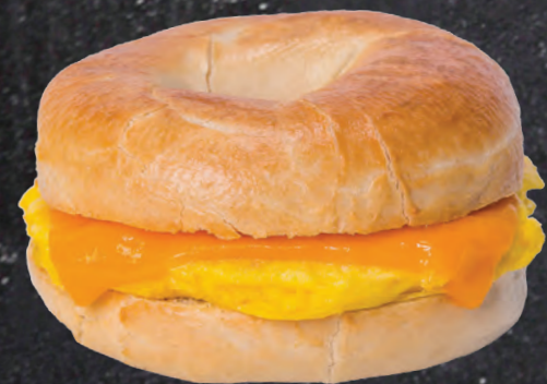
Egg & Cheese Sandwich 5.99