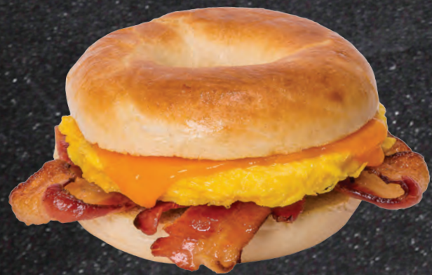
Bacon, Egg & Cheese Sandwich 6.59

breakfast sandwiches served on your choice of english muffin or bagel add hash browns 1.59 | add bacon 1.00