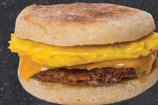
Sausage, Egg & Cheese Sandwich 6.59